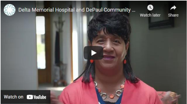
Delta Memorial Hospital and DePaul Community Health Centers Address Socioeconomic Challenges to Strengthen Community Care Coordination