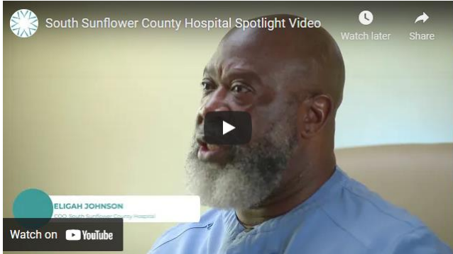
South Sunflower County Hospital Improves Financial Stability and Focuses on Growth