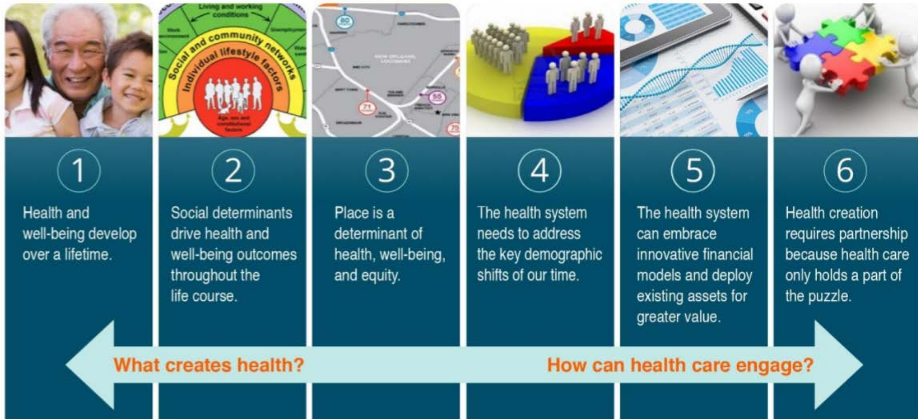
Figure 1. Six Foundational Concepts of Pathways to Population Health