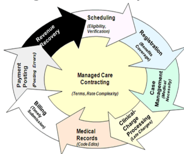
Figure 1: Revenue Cycle 1

The Healthcare Financial Management Association (HFMA) defines revenue cycle as " All administrative and clinical functions that contribute to the capture, management, and collection of patient service revenue ". 2 Figure 1 provides an overview of the revenue