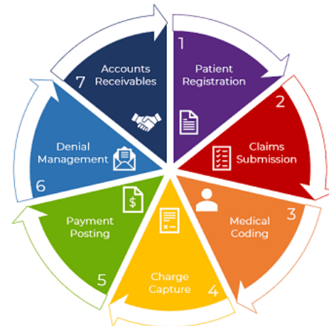
Figure 3: Revenue Cycle Management 13

Utilize this check list to review your hospital's current processes to evaluate the opportunity for adopting best practices.