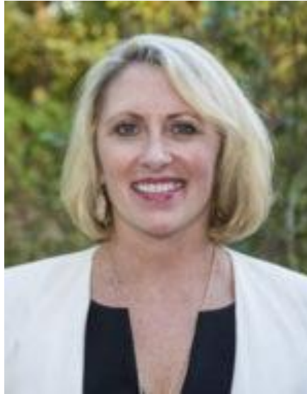
Maggie Sauer Foundation for Health Leadership & Innovation, Inc.