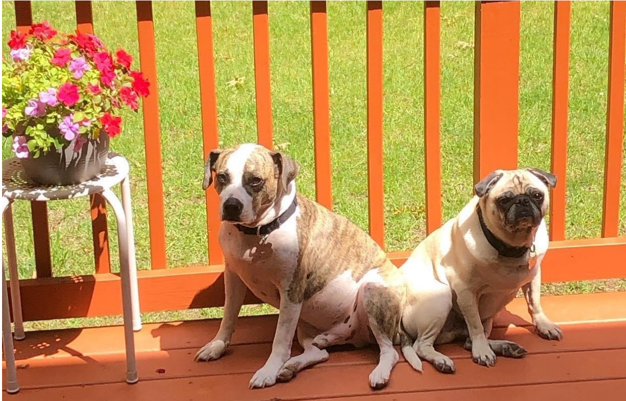
Ryder & Buster

National Organization of State Offices of Rural Health